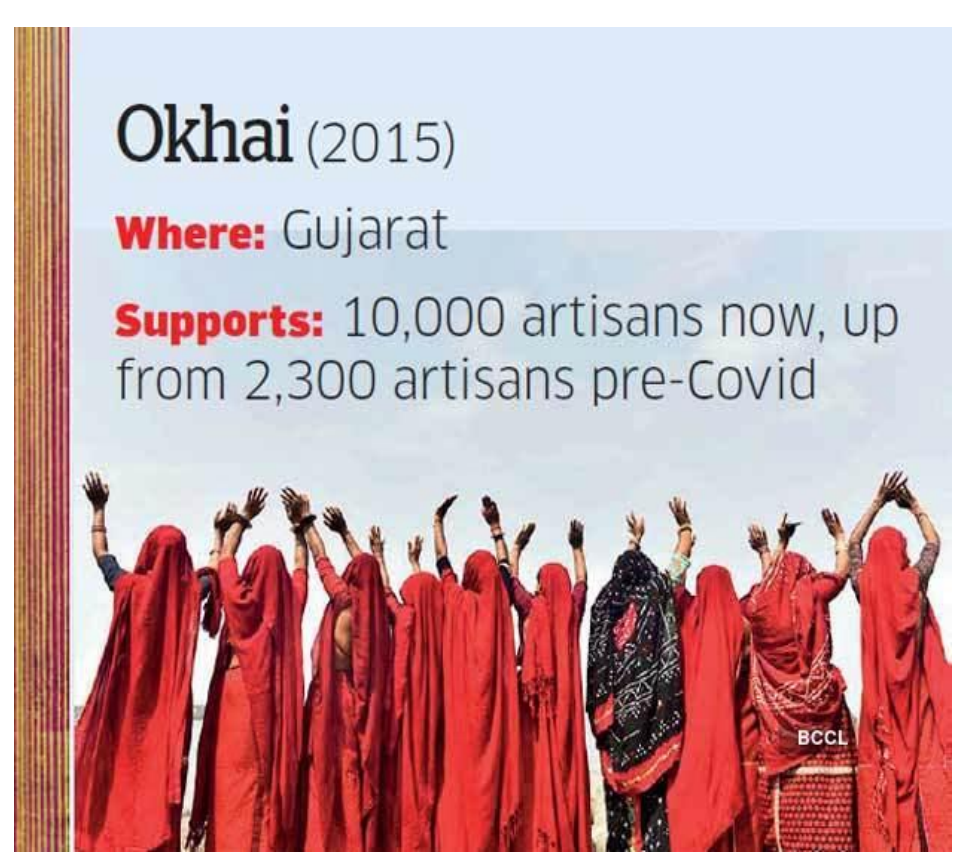
Figure 5. NGO of women handloom

In April, revenue was down by 44% year-over-years, but July saw a 157% jump. It also saw a 186% rise in spending in the 18-20 age group. #VocalForLocal is catching on. Poonia says, "On the consumer side, sentiments, like made in India and boycott of China, are coming together to help handicrafts. We can push for India as an ethical, handmade factory for the world (Pradeep Kumar Hota, Boby Chaitanya Villari & Balaji Subramanian, 2018).