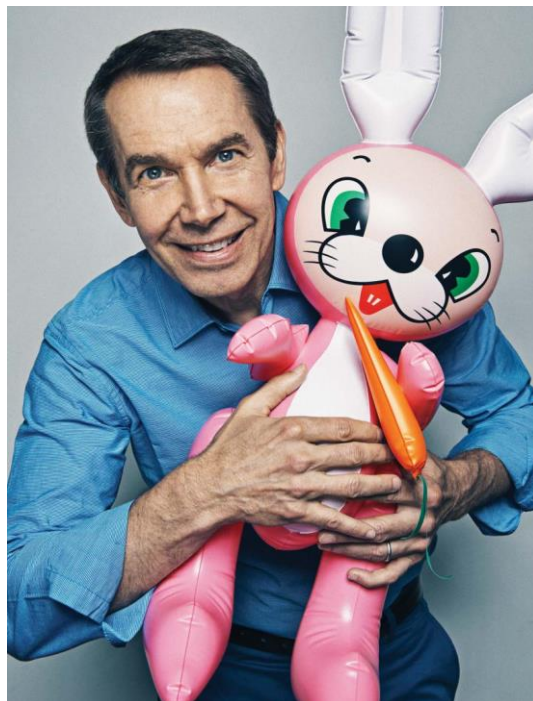
Jeff Koons: absolutely resolute in a deeply disturbing allegiance to soullessness and kitsch, and thereby a genuine and fascinating artist