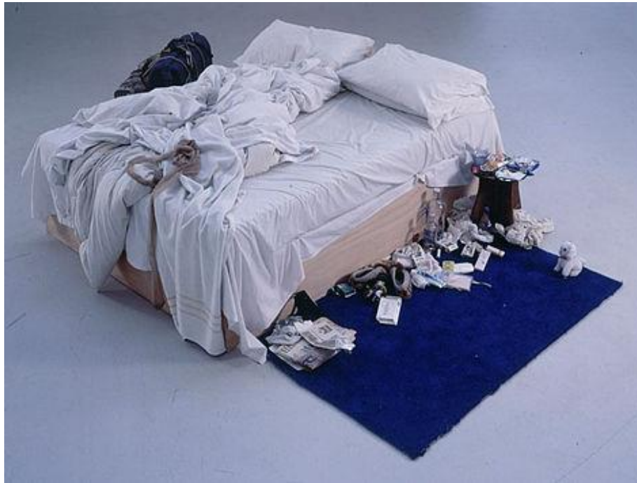
Emin's My Bed (1998): nothing strange or disturbing here: it is no more than exactly what it looks like

unquestionably effective as it is successful; it is simply to say that none of what she does qualifies, by our definition, as 'art'.