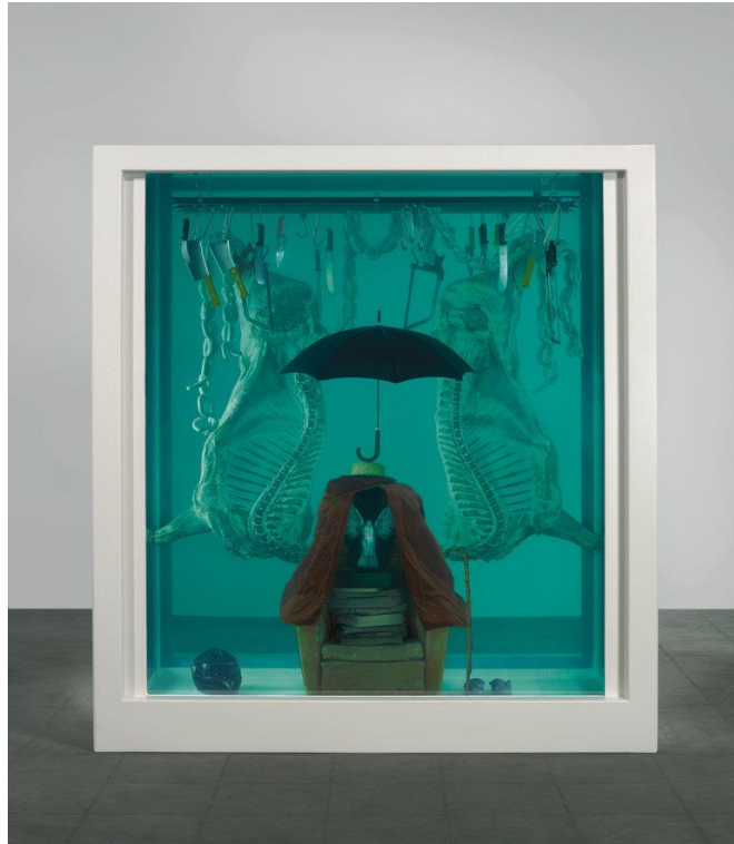
Hirst: The Pursuit of Oblivion (2004), & many others like it: a little too calculated and cannily contrived to be convincing